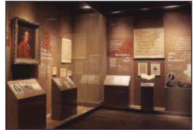
The history of our nation displayed.

The graph illustrates the blocking effectiveness of UF-96 as compared to other products, with the Percent Transmission axis signifying the light transmission of the acrylic at a given wavelength. Light below 400nm is considered to be ultraviolet. As you can see, almost all of the ultraviolet rays are blocked by UF-96, giving you the clearest, strongest guardian for your items.