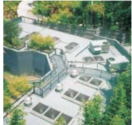
A typical skylight application at The San Diego Zoo.

• Delivery: Fast delivery is a hallmark of Spartech Polycast. Stocking locations are strategically located in California, Florida, Illinois, New Jersey and Texas.